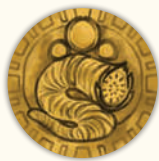
HIEREG TOKEN BACK

Five of the Discovery tokens are locations, and remain in place when revealed. A location token is not considered occupied when revealed. At the start of the next turn, before the storm (and movement of the Ixian Hidden Mobile Stronghold), any faction in a territory with a Discovery token that was just revealed may move some or all non-advisor forces in that territory into the location.