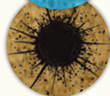
Atomics Aftermath token

From this turn forward, your hand limit is reduced by 1 (as well as your ally's), discarding a random card if a hand exceeds the limit.