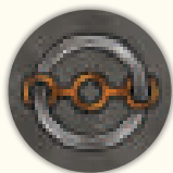
SMUGGLER TOKEN BACK