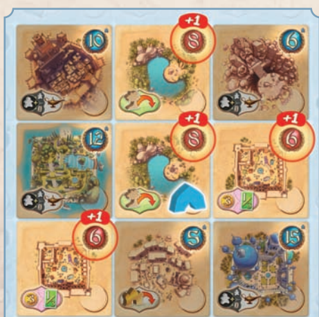
This Tent allows this player to score 8+4=12 VP at game end.