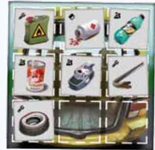
Cargo bay with different items (example for 4 players)