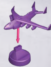
1 Plane with stand