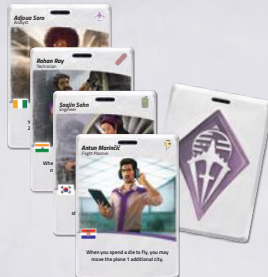
7 Role Cards