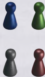
4 Player Pawns (1 each of 4 colors)