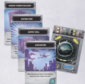
15 Crisis Cards