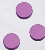
9 Time Tokens