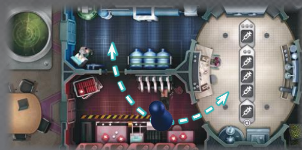
You could spend any die to move through an open door to either adjacent room.

To move, spend any one of your rolled dice to move your pawn through an open door from your current room to an adjacent room. The result showing on the spent die does not matter.