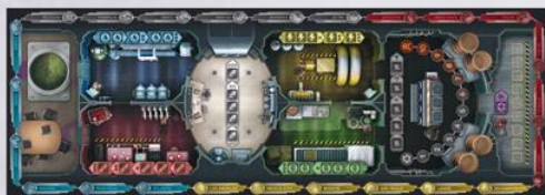
1 Plane Board