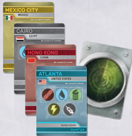
24 City Cards