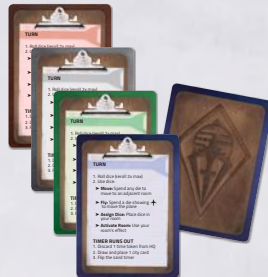
4 Reference Cards