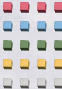
20 Supply Crates (4 each of 5 colors)