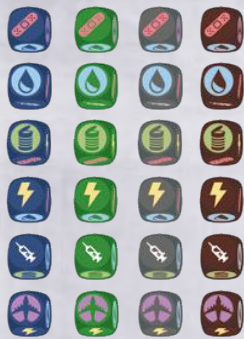
24 Dice (6 each of 4 colors)