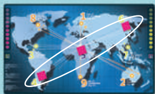
Ex.: Three on the main axis

You are a hacker completing missions for money and reputation. Your mission is to infect with your virus markers all three servers of a main axis (3-5-7, 1-5-9, 8-5-2, 4-5-6), or all three Northern, Eastern, Southern or Western servers (8-1-6, 6-7-2, 4-9-2, 8-3-4), or destroy one with a triple attack (three markers on the same server).