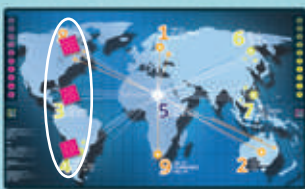
All three Western