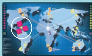
Three on the same server