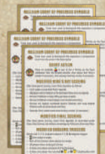
4 COURT PLAYER AIDS