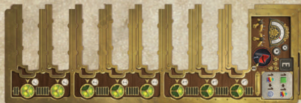
2 NEW EXPERIMENT BOARDS (E AND F)