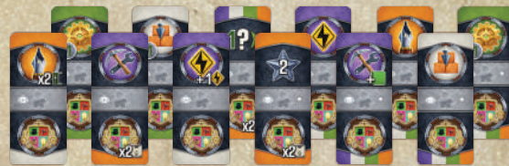
12 NEW ACTION TILES