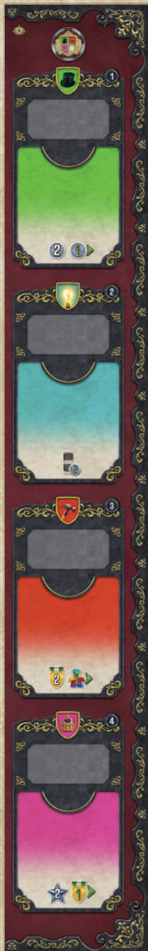
1 COURT SIDE BOARD

NOTE: Experiment F is playable with the base game without the rest of this expansion. In this case: 1) leave the Experiment F Alternative Starting Action tile depicting the Court action in the box, and 2) use the one marked with "*" instead. No additional special setup is required. The rest of these rules assume you are using the complete expansion. Experiment E can only be played with this expansion. The new Experiments are also compatible with Nucleum: Australia.