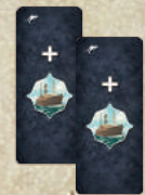
2 SPECIAL SHIPPING TILES (TO USE WITH THE NUCLEUM: AUSTRALIA EXPANSION)