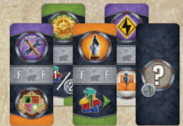
5 STARTING ACTION TILES FOR EXPERIMENT F