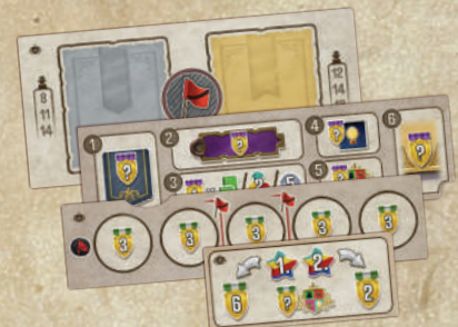
4 SIDE BOARD OVERLAYS