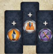
3 EXPERIMENT F CHAINING TILES