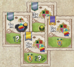
4 NEW CONTRACT TILES