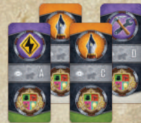
4 ALTERNATIVE STARTING ACTION TILES (ONE EACH FOR EXPERIMENT A-D)