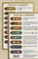
2 EXPERIMENT PLAYER AIDS