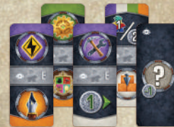
5 STARTING ACTION TILES FOR EXPERIMENT E