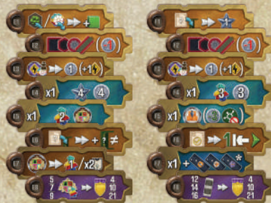
16 NEW TECHNOLOGY TILES