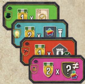
4 PARTY AGENDA TILES (DOUBLE-SIDED)